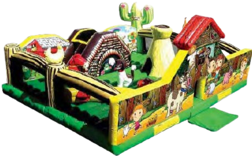
MY LITTLE FARM